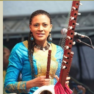
Ms. Sona Jobarteh (DDF51) Career Mentoring and Development Gambia Academy